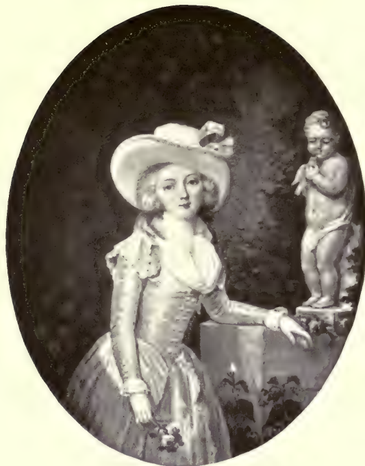
A GRAND-DAUGHTER OF NATTIER, THE ARTIST BY LOUIS SICARDI